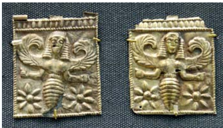
7th century BCE Gold placques embossed with the winged bee-goddesses, perhaps the Thriai. Found at Camiros Rhodes.

These three maidens who taught Apollo to prophecy even before Zeus granted him the ability to know the divine mind are usually identified as the Thriae (or Thriai , the name means pebbles and is thought to refer to small stones used in some system of divination. Most intriguing are their names. They were called Melanie ("the Black"), Kleodora ("Famed for her Gift"), and Daphnis ("Laurel").