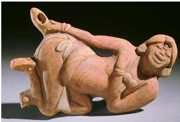
Guatemala Escuintla Maya culture, Escuintla, Middle-Late Classic periods, A.D. 400-850

In the New World another system of administering a honey based drug was used particularly by the Maya. Archeologists excavating Mayan tombs turned up tubes (of rubber?) whose function was unclear. Paintings found on a number of vases illustrate in detail the use of these tubes. One illustration shows a recumbent figure with his legs spread. He is receiving an enema which is being administered by a person (woman?) standing beside him holding a container connected to a tube. There is also another male ladling enema fluid out of a large jar. Another painting of this kind shows an attractive young woman (goddess?) removing the clothing from a to a male (god?). In front of her are the enema container and what looks like a rubber enema bulb syringe. Besides paintings there is even statuary with the same theme.